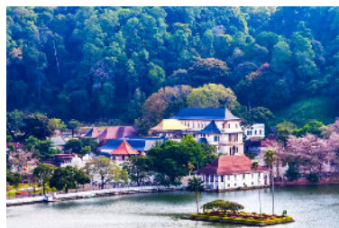
Temple next to Kandy Lake