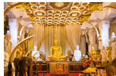
The Sacred Tooth Relic Temple