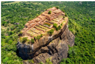
Birds Eye view of the Rock

This memorable tour is crafted to give you a profound sense of Sri Lanka's rich cultural and historical tapestry.