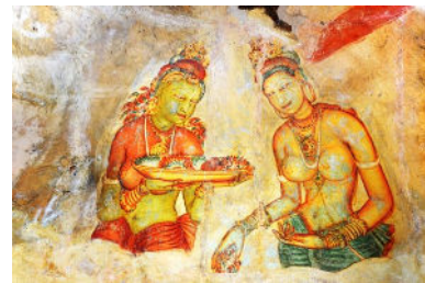
480 AD Sigiriya Frescoes