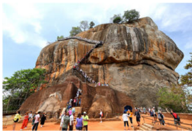
Entrance to Sirgiriya Rock