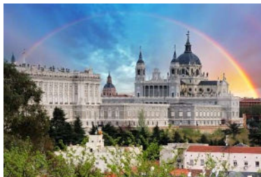
Royal Palace and Almudena Cathedral, Madrid

This is an unforgettable adventure through Spain's rich cultural tapestry.