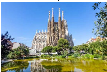
Sagrada Familia Cathedral, a UNESCO World Heritage Site