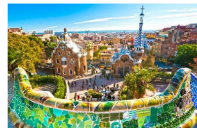
Park Güell has a beautiful view over Barcelona