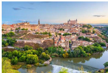
Panoramic View of Medieval Toledo