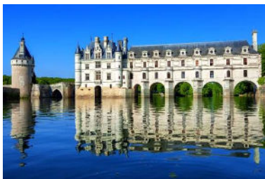
Chateau de Chenonceau, Loire Valley