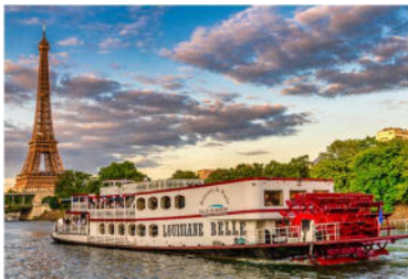
Eiffel Tower and Seine River

Visit Paris the famous capital of France. Visit the iconic Arc de Triomphe. Enjoy sweeping views of the iconic Eiffel Tower, Notre Dame, Louvre Museum and more. Explore Mont Saint Michel, Versailles Palace or chateaus of Loire Valley.