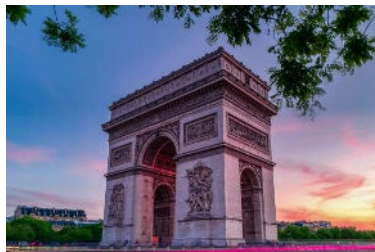
Arc de Triomphe