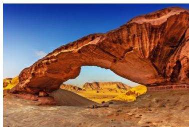
Wadi Rum Desert