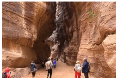
Siq, the path to Petra