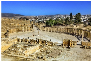
Forum and Colonnade Street in Jerash Ruins

A memorable journey that transcends time, cultures, and nature. Embark on an unforgettable private tour through the heart of Jordan, a land steeped in history and blessed with natural wonders. From the vibrant streets of Amman to the ancient ruins of Petra, the lunar landscapes of Wadi Rum, and the serene waters of the Dead Sea, this tour promises a mosaic of experiences that are as diverse as they are mesmerizing.