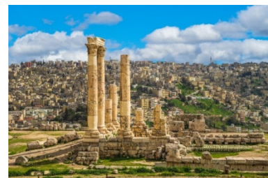
Temple of Hercules, Amman Citadel in Amman city