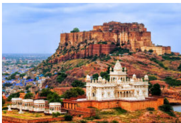
Mehrangarh Fort & Blue City

Awe at the magnificent hilltop Mehrangarh Fort and Amber Fort. The golden sands of the vast Thar Desert in Rajasthan are a true treasure waiting to be uncovered. Soak in the history of the desert kingdom by exploring the ancient trading centers, their historic forts and Jain temples in yellow sandstone. Take part in a Camel Safari and a sunset dinner on the sand dunes followed by bliss on the stunning lakes.