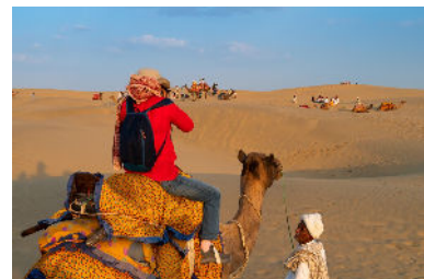
Camels on the Sand Dunes