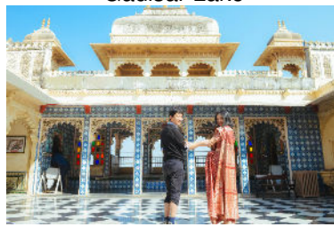
Even Priyanka Chopra & Nick Jonas had their Wedding in Beautiful Udaipur