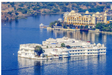
Lake Palace, Udaipur