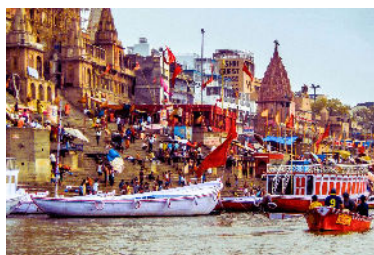
Boat Ride at Ganges river is a quintessential Varanasi experience