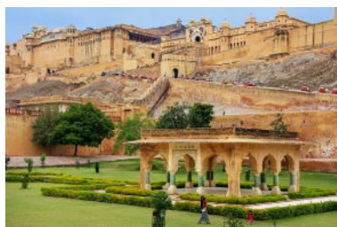
The majestic Amber Fort with large ramparts and palace