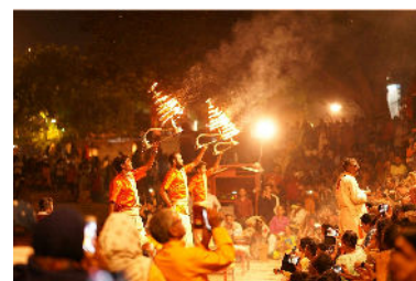
Evening Aarti Ceremony is a mesmerizing spectacle and a spiritual experience