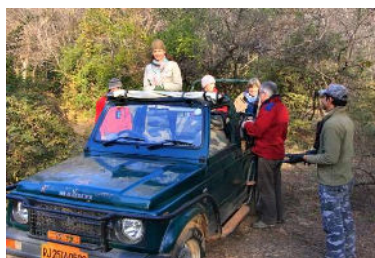
Tiger Jeep Safari