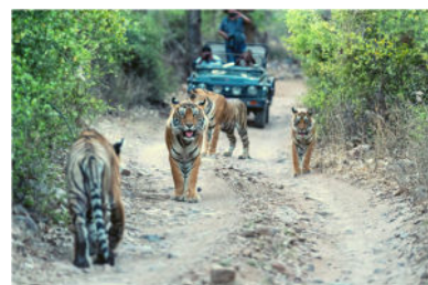
Tigers in Ranthambore Park