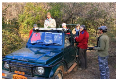
Tiger Jeep Safari