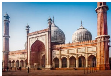
Jama Masjid Mosque