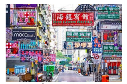
Neon Signs in Mong Kok