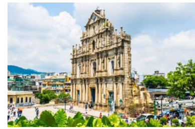
Ruins of St Paul's, Macau