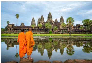
Angkor Wat, a UNESCO site