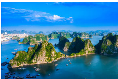
Ha Long Bay Overnight Cruise

In Vietnam there's a new adventure at every turn which includes cruising-in-style on Ha Long Bay (UNESCO World Heritage Site) as well as visits to top cities such as Hanoi and Ho Chi Minh City. Capture the past and present influences in these cities from colonial France to the Vietnam War. The awe-inspiring temples of Angkor Wat, Bayon Temple and Angkor Thom in Cambodia are the most iconic ruins in the world and the top reason why many tourists visit Cambodia.