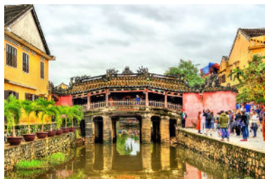
Japanese Bridge, Hoi An