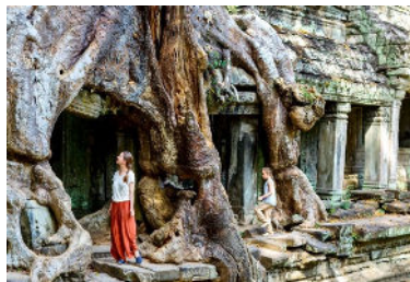
Preah Khan Jungle Temple (Raiders of the Lost Ark film location)