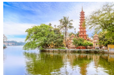
Tran Quoc Pagoda, Hanoi