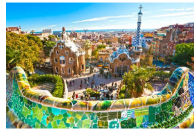
Park Guell, Barcelona