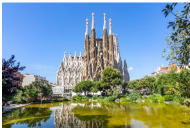
Sagrada Família Cathedral, Barcelona

Barcelona, the capital of Catalonia, is one of the most vibrant and cosmopolitan cities in Spain. It sits between the Mediterranean Sea on one side and the Collserola mountain range on the other. The famous attractions include Gaudi's architecture, tapas bars, restaurants and markets that offer traditional Catalan fare. Stroll down La Rambla, a famous boulevard that runs through the heart of the city.