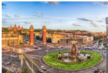
Plaça d'Espanya, Barcelona City