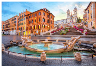
Spanish Steps, Rome