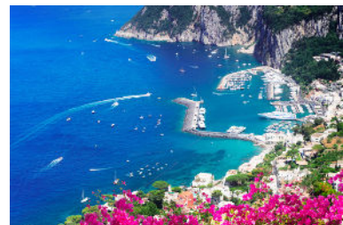
Capri island, Amalfi Coast