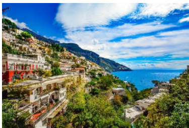
Positano, Amalfi Coast