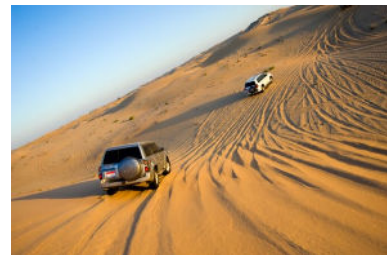
Sand Dune Bashing