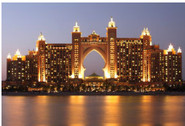
Atlantis - The Palm

Roam free on the desert and watch the sunset on the golden sand dunes. Soak into the local culture and delicious Arabic cuisine on this journey.