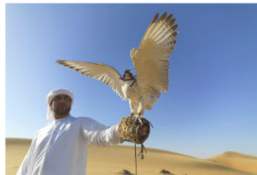
Falcon, Dubai Desert