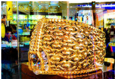
64 kg Gold Ring at Gold Souk