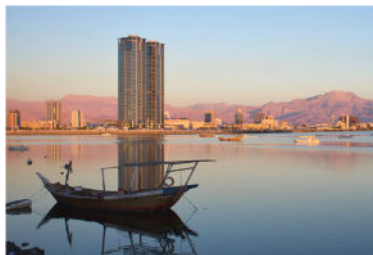
Ras al Khaimah