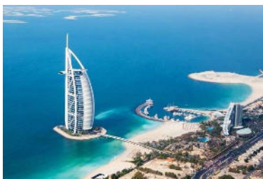
Burj Al Arab

Explore neighboring Abu Dhabi, the capital city of the United Arab Emirates (UAE). See the giant 24-carat gold gilded Swarovski chandeliers in the national mosque. Visit the Louvre Abu Dhabi Museum which showcases ancient artifacts and heritage from the Middle East. Experience amazing desert adventures and delicious local cuisine on this memorable tour.