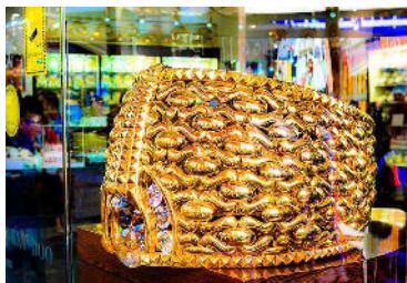
64 kg Gold Ring at Gold Souk