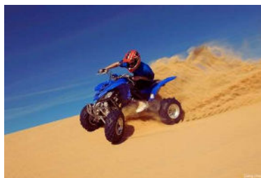
Sand Dune Bashing on ATV