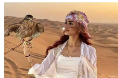
Falcon Experience, Dubai Desert