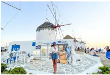
Stroll through the delightful, sun-bleached villages and take in the sight of Mykonos' iconic windmills