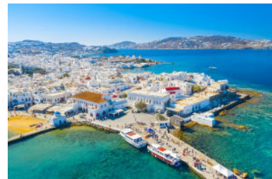
Mykonos Harbor with the Hilltop Windmills