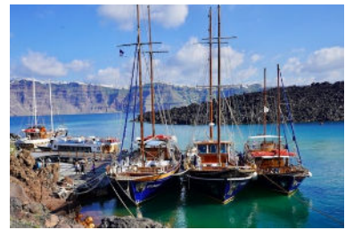
Boat excursion to the volcanic caldera of Santorini