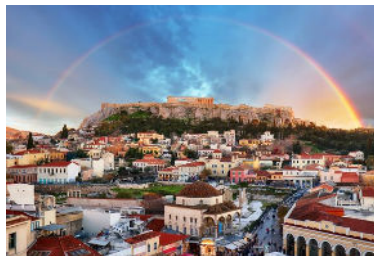
Athens City & Acropolis