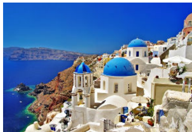
Oia Village, Santorini