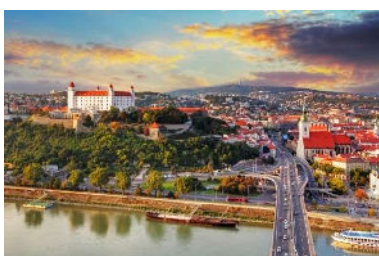
Bratislava, the capital of Slovakia, by the Danube River