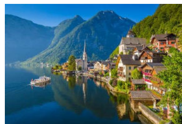
Hallstatt, a UNESCO World Heritage Site with traditional Alpine houses