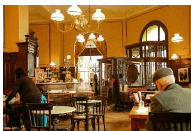
Enjoy a cup of famous Viennese coffee with old world charm