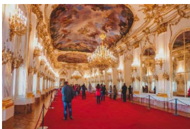
Opulent rooms in Schönbrunn Palace, Vienna