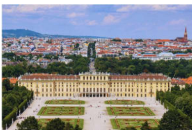
Schönbrunn Palace, a former imperial summer residence

Explore famous Vienna on an amazing stopover tour, beginning with a visit to Schönbrunn Palace. You next have a choice to visit Hallstatt in the beautiful alpine regions of Salzkammergut, or Bratislava, the beautiful capital city of Slovakia. This journey offers a blend of historic Austrian landmarks, authentic culture and stunning Austrian Alps scenery. This is your chance to relax in delightful Viennese cafes and taste flavorful Vienna coffee, pastry, pancakes and regional sausages.