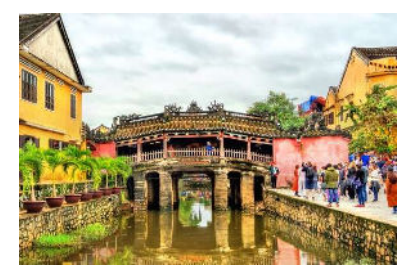
Japanese Bridge, Hoi An