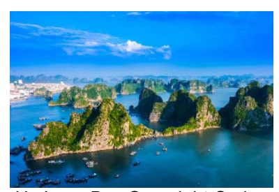
Ha Long Bay Overnight Cruise

Discover the delightfully captivating blend of Vietnam and Cambodia. Experience the magic of cruising on Ha Long Bay with amazing limestone caves. Explore the dynamic cities of Hanoi and Ho Chi Minh City (Saigon). Enjoy live cooking classes in scenic Hoi An. Marvel at the ancient wonders of Angkor.