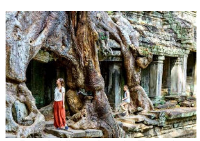
Preah Khan Jungle Temple (Raiders of the Lost Ark film location)