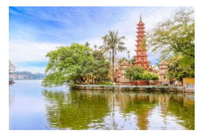
Tran Quoc Pagoda, Hanoi