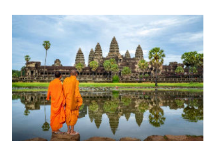
Angkor Wat, a UNESCO World Heritage site