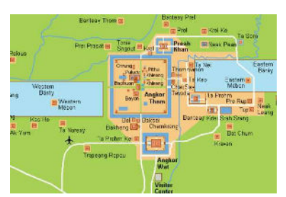
Angkor Temple Complex