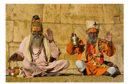
Sadhus (Holy Men), India