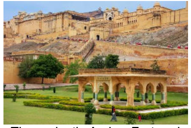
The majestic Amber Fort and palace with large ramparts