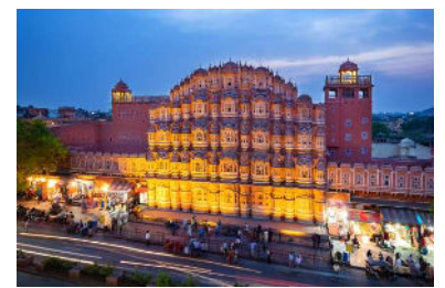
Hawa Mahal (Palace of the Winds): Lattice windows for royal ladies to observe street life without being seen