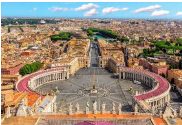
St Peter's Square, Vatican City

Step right up for an unforgettable Italian adventure! Get ready to explore the Eternal City of Rome, where ancient history whispers from every ruin and Renaissance masterpieces stand proudly. Continue to Florence, the birthplace of the Renaissance, before heading to marvel at Pisa's iconic Leaning Tower. Prepare to be swept off your feet by the romantic canals of Venice and witness the mesmerizing artistry of glassmaking on Murano island. But wait, there's more! Enjoy a delightful wine tasting in Chianti.