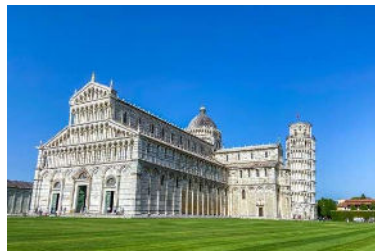
Pisa, Leaning Tower and Cathedral