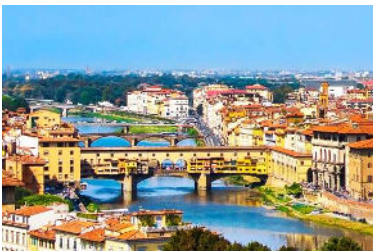
Ponte Vecchio, Florence