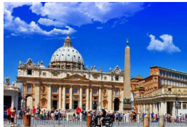
St Peter's Basilica