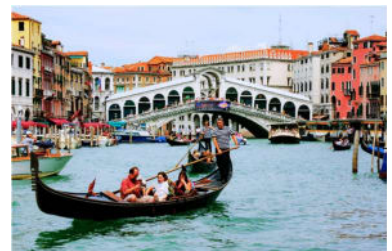
Gondolas and Rialto Bridge, Venice