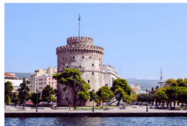
White Tower of Thessaloniki