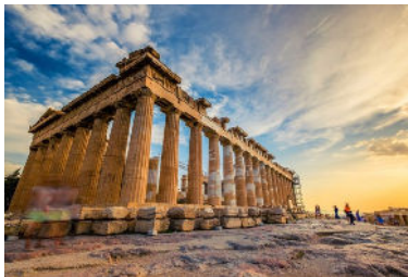
Parthenon at sunset

Begin your journey in Athens to explore the treasures of ancient Greece. Visit the famous island of Santorini in the Aegean Sea and its iconic Oia village. Continue to Thessaloniki, the second largest city in Greece. Thessaloniki, a cultural capital of Greece is filled with ancient monuments from Byzantine, Roman and Ottoman Empires. Enjoy the local produce and delicious cuisine incorporating olive oils, cheese, herbs, and wine throughout your journey.