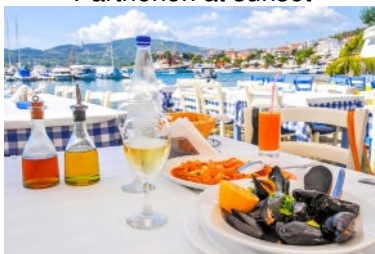
Greek Cuisine by Santorini Harbor