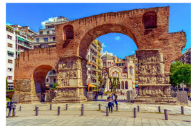
Arch of Galerius, 4th-century AD monument