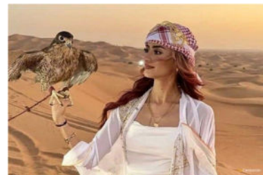
Falcon, Dubai Desert