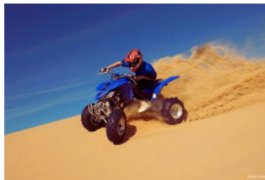
Sand Dune Bashing on ATV