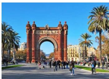
Arc de Triomf in Barcelona