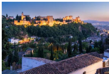
Historic Alhambra palace at night in Granada