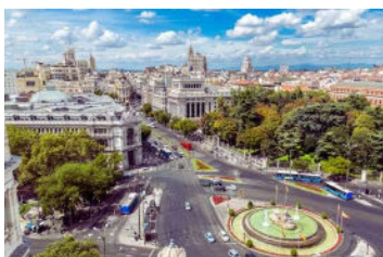
Madrid: birds eye view with Cibeles Fountain

Our Independent Tour combines the ease of guided excursions with a bit of extra free time and flexibility.