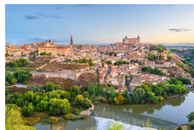
Panoramic View of Medieval Toledo