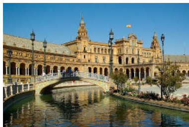
Plaza de España, Seville