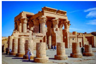
Kom Ombo Temple dedicated to a crocodile god and the falcon-headed god