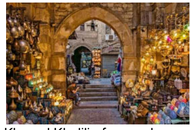
Khan el Khalili - famous bazaar in Cairo