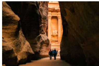
Siq, the path to Petra