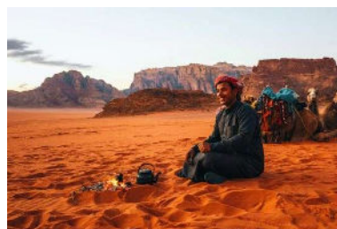
Experience Wadi Rum with a