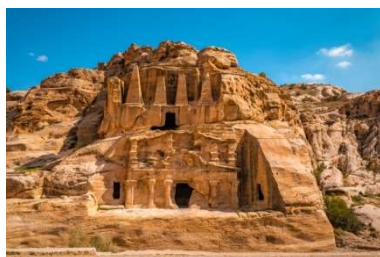
Obelisk Tomb in Petra