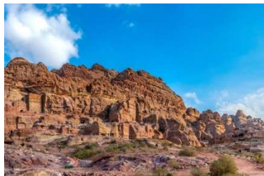
Royal Tombs in Petra

Immerse yourself in Jordan's captivating blend of ancient wonders and natural beauty. From bustling Amman to the iconic rock-carved city of Petra and the otherworldly landscapes of Wadi Rum. Unwind by the vibrant Red Sea and then experience the unique tranquility of the Dead Sea, where you can float effortlessly and indulge in its mineral-rich mud. Discover the mesmerizing historical and cultural mosaic that is Jordan.