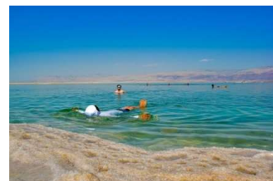
Relax on a serene beach on the Dead Sea