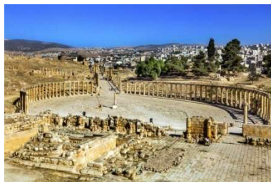
Forum and Colonnade Street in Jerash Ruins

Journey through Jordan in a week and discover a land where ancient mysteries whisper from sun-baked stones. Marvel at the rose-red city of Petra , a stunning archaeological wonder. Immerse yourself in Bedouin culture in the mesmerizing Wadi Rum desert. Dive into the vibrant marine life of the Red Sea and experience the unique sensation of floating effortlessly in the Dead Sea . Explore Roman ruins, biblical sites, and Crusader-era castles, making this more than just a trip — it's a profound journey through a timeless mosaic of history and culture.