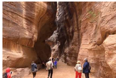
Experience Petra, starting with the iconic Siq walk