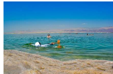
Relax on the serene beach on the Dead Sea