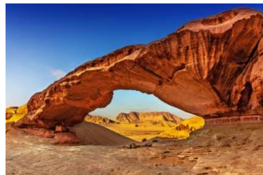
Wadi Rum Desert