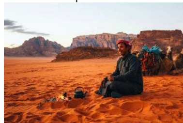
Experience Wadi Rum with a Bedouin guide