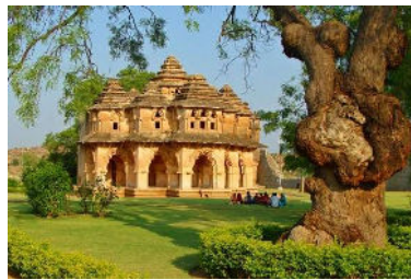
Lotus Palace, Hampi