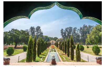
View from Palace of Tipu Sultan, Srirangapatna