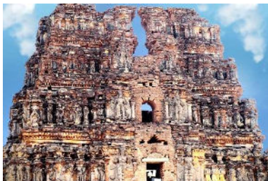
Temple Ruins, Hampi