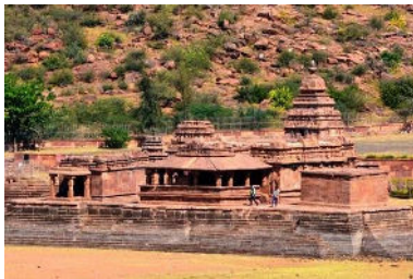
Badami Rock-Cut Cave Temples

Explore India's diverse wonders: ancient Badami and Hampi ruins, lush Chikmagalur and Coorg hills, Nagarhole's wildlife safaris, Mysore's royal grandeur, and vibrant Bangalore. This trip blends rich history and stunning landscapes with thrilling nature experiences for travelers seeking culture and adventure.