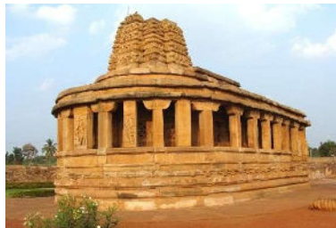
Durga Temple, Aihole