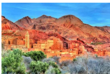
Kasbah fortress in Dades Valley