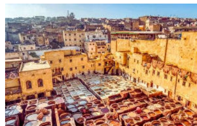
Fez, Morocco's cultural and spiritual capital