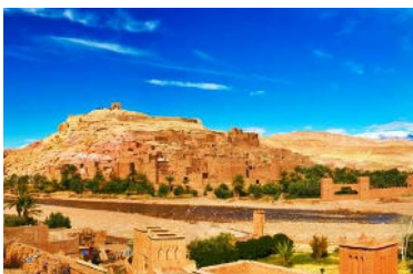
Majestic medieval architecture, Merzouga