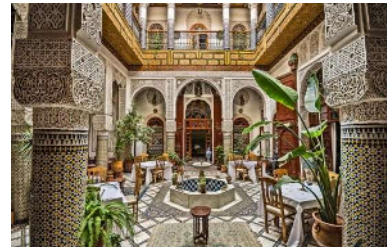
Rich textures and intricate patterns of Moroccan Interior