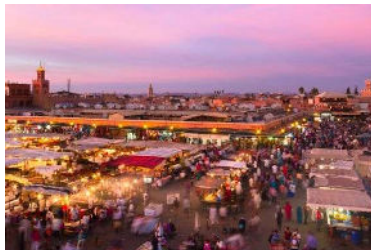
Evening food stalls at Jemaa el Fnaa Square, Marrakech