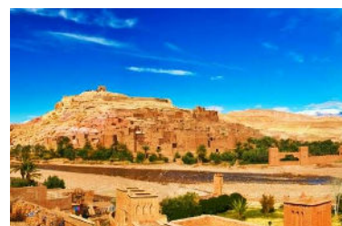
Majestic medieval architecture, Merzouga