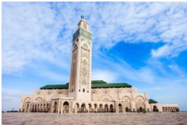
Hassan II Mosque, Casablanca

This tour offers a rich tapestry of Berber, Arab, African, and European cultures and history, together with breathtaking scenery. Experience Morocco's rich culture through its intricate tilework, hand-woven carpets, and aromatic cuisine, including flavorful tagines and couscous.