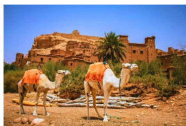
Ait Ben Haddou (ancient fortress) near Ouarzazate