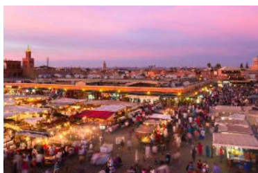
Evening food stalls at Jemaa el-Fnaa, Marrakesh