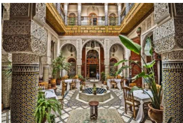
Rich textures and intricate patterns of Moroccan Interior