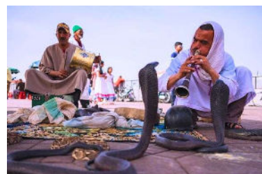
Snake Charmers in Jemaa el-Fnaa square