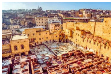
Leather Tannery in Fez