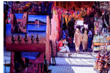
Shops in Marrakesh