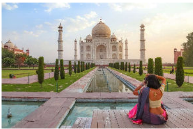
Taj Mahal, an iconic symbol of love

This is a golden odyssey through India's royal past.