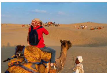
Camels on the Sand Dunes, Thar Desert