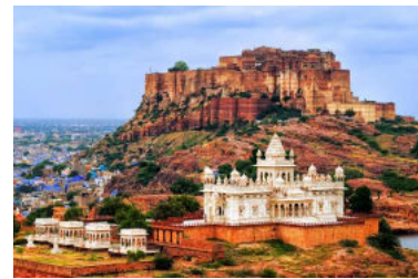
Mehrangarh Fort and Blue City