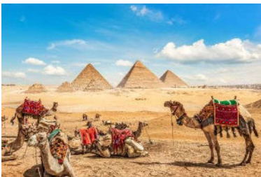
Camels resting near the great pyramids in Giza