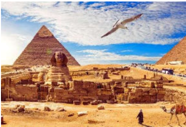
Pyramids and Sphinx, Giza

An unforgettable adventure through ancient wonders and vibrant landscapes.