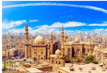
Cairo Citadel and Mosque