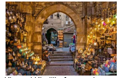
Khan el Khalili - famous bazaar in Cairo