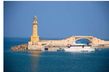
Light House, Alexandria