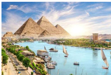
Pyramid complex in Aswan