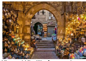
Khan el Khalili - famous bazaar in Cairo