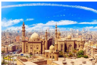
Cairo Citadel and Mosque