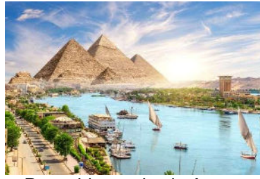
Pyramid complex in Aswan