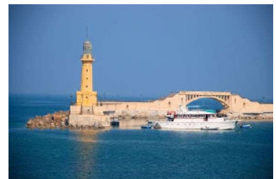
Light House, Alexandria