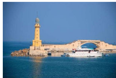
Light House, Alexandria