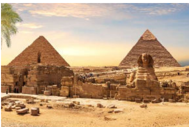
Pyramids and Sphinx, Giza

Explore the wonders of ancient Egypt, from the iconic Pyramids and mysterious Sphinx of Giza near bustling Cairo, to the incredible Valley of the Kings and Hatshepsut's Temple near Luxor. A relaxing Nile cruise will then carry you south to Aswan city, completing this unforgettable journey through pharaonic history and stunning landscapes. Experience the country's most iconic landmarks in comfort and style, with expert guides. Whether you're captivated by Egypt's ancient history or the serenity of the Nile, this tour promises to be a journey you will never forget.