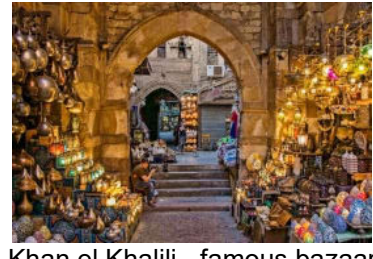
Khan el Khalili - famous bazaar in Cairo