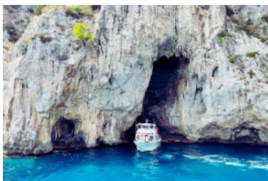
Capri boat excursion to explore limestone sea caves