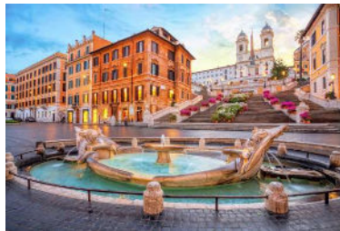
Spanish Steps, Rome