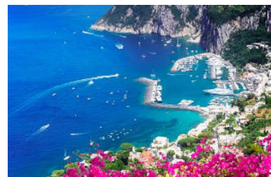
Capri island, Amalfi Coast