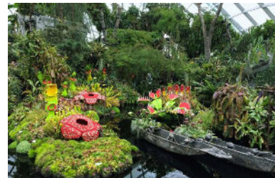
Cloud Forest, Gardens by the Bay