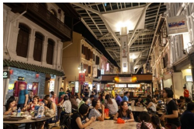
Street Food at China Town