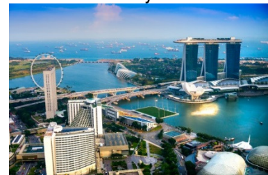
Singapore Skyline (Marina Bay & Gardens By the Bay)