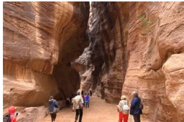
Siq, the path to Petra