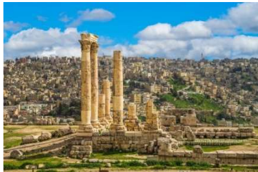
Temple of Hercules, Amman Citadel in Amman city

Step into Jordan , where ancient mysteries whisper from sun-baked stones and breathtaking landscapes unfold around every bend. Begin your adventure in bustling Amman , explore the Roman ruins of Jerash , and marvel at the rose-red city of Petra . Venture into the Wadi Rum desert, dive into the Red Sea , and float effortlessly in the Dead Sea . Jordan isn't just a destination; it's a profound journey through a mesmerizing historical and cultural mosaic.