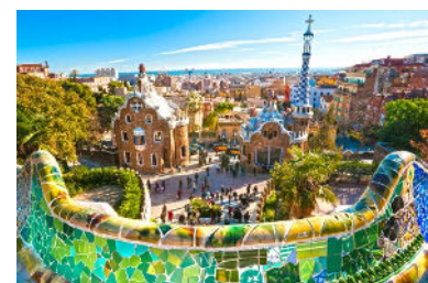
Park Güell, Barcelona