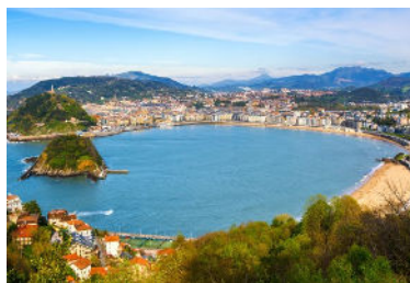
La Concha Beach, San Sebastian