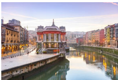
Ribera market on river Nervion, in Bilbao

This trip takes you from historic Basque Country to cosmopolitan Barcelona. You'll experience the contrast between the distinct Basque culture, stunning beaches, and world-renowned gastronomy, and the vibrant, artistic, and historic allure of Barcelona in Catalonia. Bilbao is home to the iconic Guggenheim Museum. San Sebastian was once a favorite destination for Spanish royalty and is famous for its pintxos (small snacks) and culinary innovation. Barcelona is renowned for Gaudí's architecture (Sagrada Familia, Park Güell, and Casa Batlló), relaxed Mediterranean lifestyle and delicious tapas.