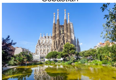
Sagrada Familia Cathedral, Barcelona