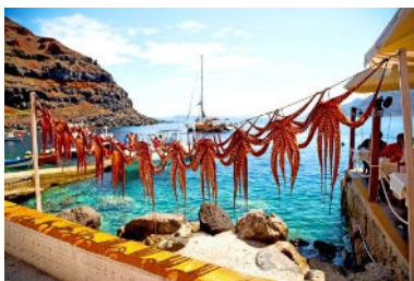
Octopus drying in Santorini