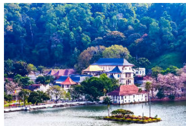
Temple next to Kandy Lake