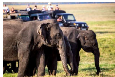
See elephants in the nature