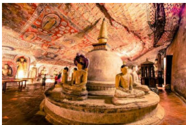
This ancient temple complex showcases 150 stunning Buddha statues