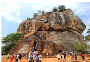
Entrance to Sigiriya Rock