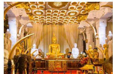
Temple of the Sacred Tooth Relic