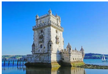
Belem Tower, Lisbon