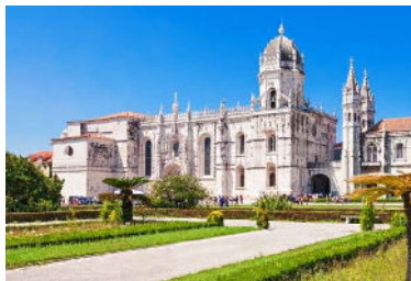
Jerónimos Monastery, Lisbon