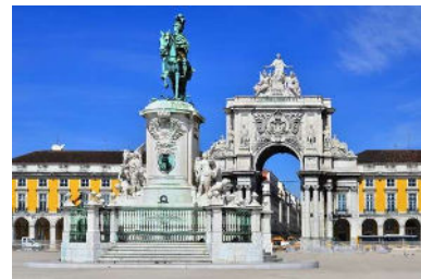
The Praça do Comércio (Commerce Square), Lisbon