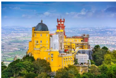
Pena National Palace, Sintra