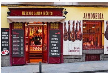
Taste of Tapas & Jamon (Ham)