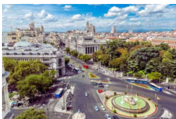
Madrid: birds eye view with Cibeles Fountain

Our Independent Tour combines the ease of guided excursions with a bit of extra free time and flexibility.