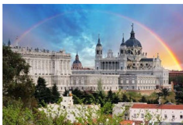
Royal Palace and Almudena Cathedral, Madrid