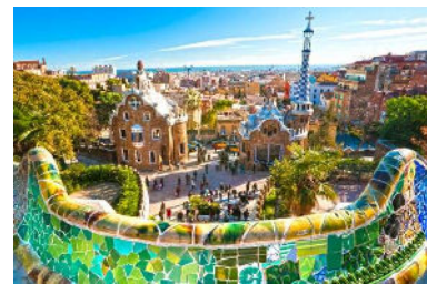
Park Güell, Barcelona