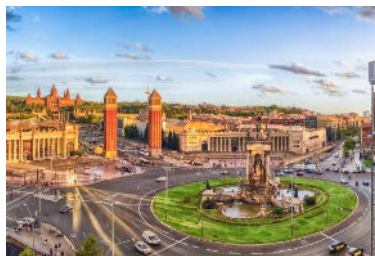
Placa d'Espanya, Barcelona City