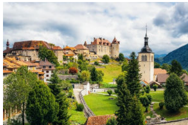
Gruyères Medieval Town