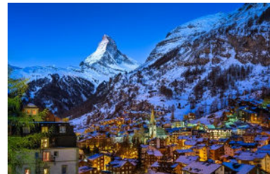
Zermatt Village with Matterhorn Peak