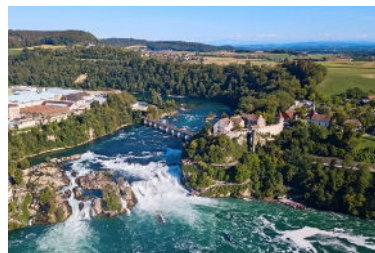
Rhein Falls - the biggest waterfall in Europe