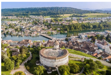
Munot Castle in Schaffhausen Old Town