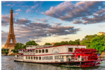
Eiffel Tower and Seine River

Embark on a captivating journey through the heart of France on our Paris, Bordeaux, and Marseille tour. Begin in the iconic City of Light, Paris, where the Eiffel Tower and Louvre Museum beckon with cultural splendor. Travel to Bordeaux, the wine capital, where vineyard-covered landscapes and exquisite wine blends await discerning palates. Discover the vibrant Mediterranean port city of Marseille, where ancient history meets modern sophistication. Indulge in delicious cuisine, explore historic sites, and immerse yourself in the unique charm of each destination. This carefully curated tour promises an enriching fusion of French art, culture, and gastronomy, ensuring an unforgettable experience.