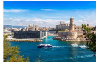
Saint Jean Castle and Cathedral de la Major, Marseilles