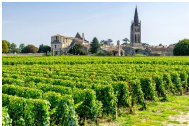
Vineyards of Saint-Emilion