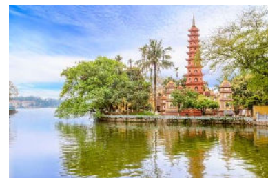
Tran Quoc Pagoda, Hanoi