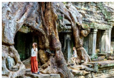
Preah Khan Jungle Temple (Raiders of the Lost Ark film location)