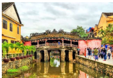
Japanese Bridge, Hoi An