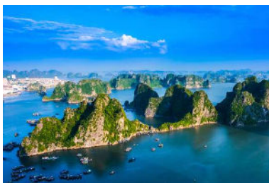
Ha Long Bay Overnight Cruise

Discover the delightfully captivating blend of Vietnam and Cambodia. Experience the magic of cruising on Ha Long Bay with amazing limestone caves. Explore the dynamic cities of Hanoi and Ho Chi Minh City (Saigon). Enjoy live cooking classes in scenic Hoi An. Marvel at the ancient wonders of Angkor.