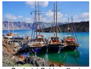
Santorini Caldera Boat Excursion