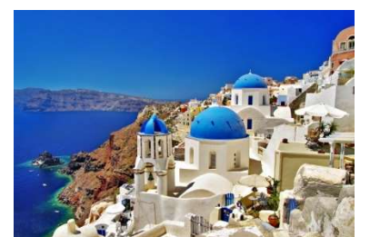
Iconic Oia village with its blue domed houses