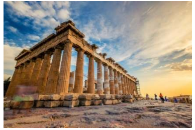
Parthenon at sunset