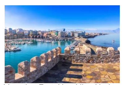
Venetian Fort, Heraklion Harbor