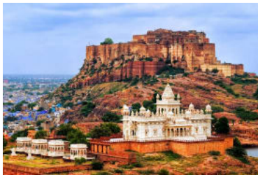
Mehrangarh Fort & Blue City

Awe at the magnificent hilltop Mehrangarh Fort and Amber Fort. The golden sands of the vast Thar Desert in Rajasthan are a true treasure waiting to be uncovered. Soak in the history of the desert kingdom by exploring the ancient trading centers, their historic forts and Jain temples in yellow sandstone. Take part in a Camel Safari and a sunset dinner on the sand dunes followed by bliss on the stunning lakes.