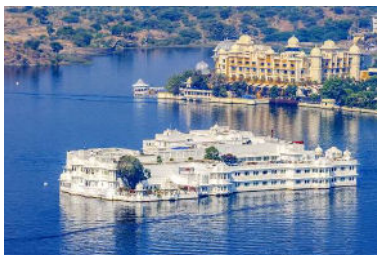
Lake Palace, Udaipur