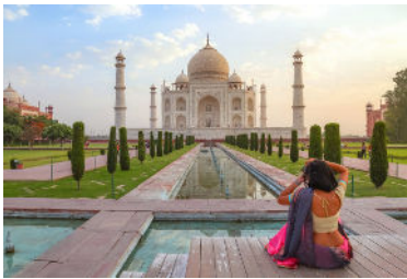
Taj Mahal, an iconic symbol of love and architecture

This grand tour is meticulously designed to offer a treasure trove of adventure and discovery, with unforgettable moments that await you.