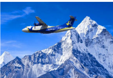
Mount Everest Scenic Flight, offering a breathtaking view of the world's highest peaks