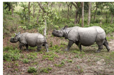
Wild One-horned Rhinos, Chitwan National Park