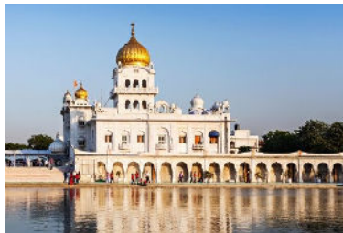
Gurudwara (Sikh Temple) with Golden Dome