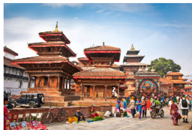
Durbar Square (Royal Square) is Kathmandu's historic center of palaces and temples