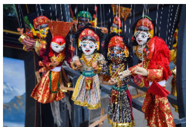
Nepalese Himalayan Puppets and Dolls