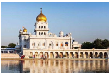
Gurudwara (Sikh Temple) with Golden Dome