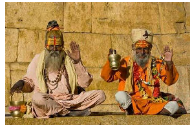
Sadhus (Holy Men), India