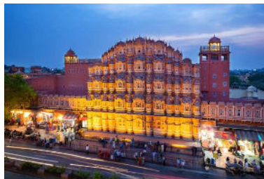
Hawa Mahal (Palace of the Winds): Lattice windows for royal ladies to observe street life without being seen