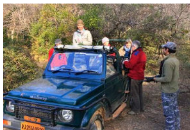
Tiger Jeep Safari