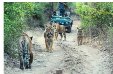
Tigers in Ranthambore Park