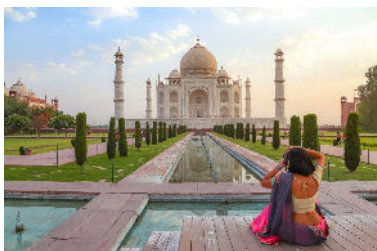
Taj Mahal, an iconic symbol of love and architecture

Witness firsthand the ancient culture of Indian and Mughal empires, and the British Raj via heritage journeys through Hindu and Islamic temples, ancient forts, grand palaces and the magnificent Taj Mahal – a grand monument which took over 22 years to complete. Then enjoy scenic wildlife adventures and spot a rich diversity of native animals including the Bengal tiger, sambar, chital, nilgai, wild boar, leopard, sloth bear and an abundance of birdlife in their natural habitat.