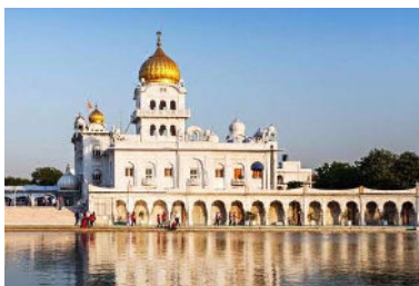
Gurudwara (Sikh Temple) with Golden Dome